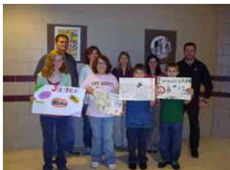
GMS poster contest winners

The 2009 Great American Smoke Out was a very busy one for Reality Check. 4 Schools in Fulton & Montgomery counties participated with doing events related to GASO, which were Gloversville Middle School, Broadalbin-Perth High School, Fonda-Fultonville High School and Mayfield Jr./Sr. High School. At Gloversville Middle School, the students participated in a poster contest that surrounded the theme of "I Would Rather ___ than Smoke!" 4 winners were picked and they each won an FYE gift card! Reality Check was at GMS giving out wristbands and information about the effects of tobacco use. At Broadalbin-Perth High School, the students from their SADD group made chalk outlines of bodies and put tobacco facts in them. Finally, Mayfield Jr./Sr. High School did a Tobacco-Free week where they handed out tee shirts that said "I Would Rather ___ than Smoke" and had the students fill in the blanks! Reality Check was there to give away prizes and information about how to quit smoking!