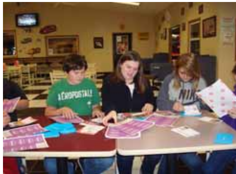
RC Youth "Stick It to Em"